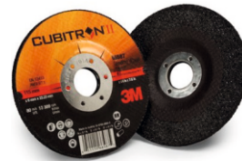
Cutting & Grinding Wheels