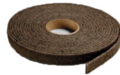
Abrasive Rolls & Strips