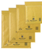
Mail lite bags