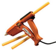
Hot Melt Adhesives

Aerosol/ canister spray adhesives Anaerobic thread lockers & retainers Cyanoacrylate adhesives One part heat cure structural adhesives Primers, activators, cleaners PVA/ wood bonding adhesives Sealants & gap fill products Solvent & water based contact adhesives Two part structural adhesives UV cure adhesives