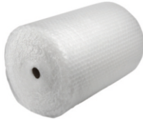
Bubble Wrap / Foam Loosefill