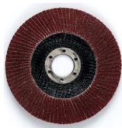
Flap Discs & Wheels