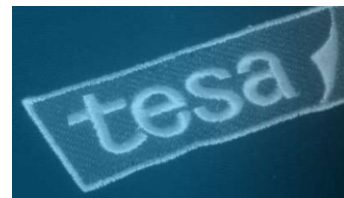
Embroidery & Transfers