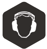
Workwear & PPE