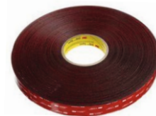
Double Sided Tapes