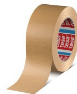
Self Adhesive Paper Tapes