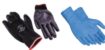
Hand & Arm Protection