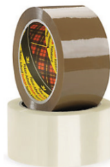
Packaging Tape & Dispensers