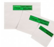
Tenzalope Green Document Wallets