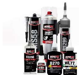
Sealants & Gap Fill