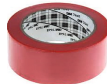
Floor Marking Tape