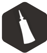
Adhesives & Sealants