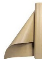
Kraft Paper Rolls