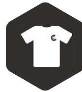
Embroidery & Heat Sealing